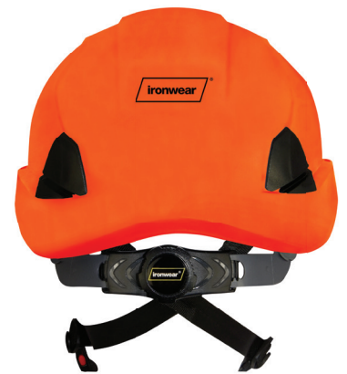
(Back with Ratchet)